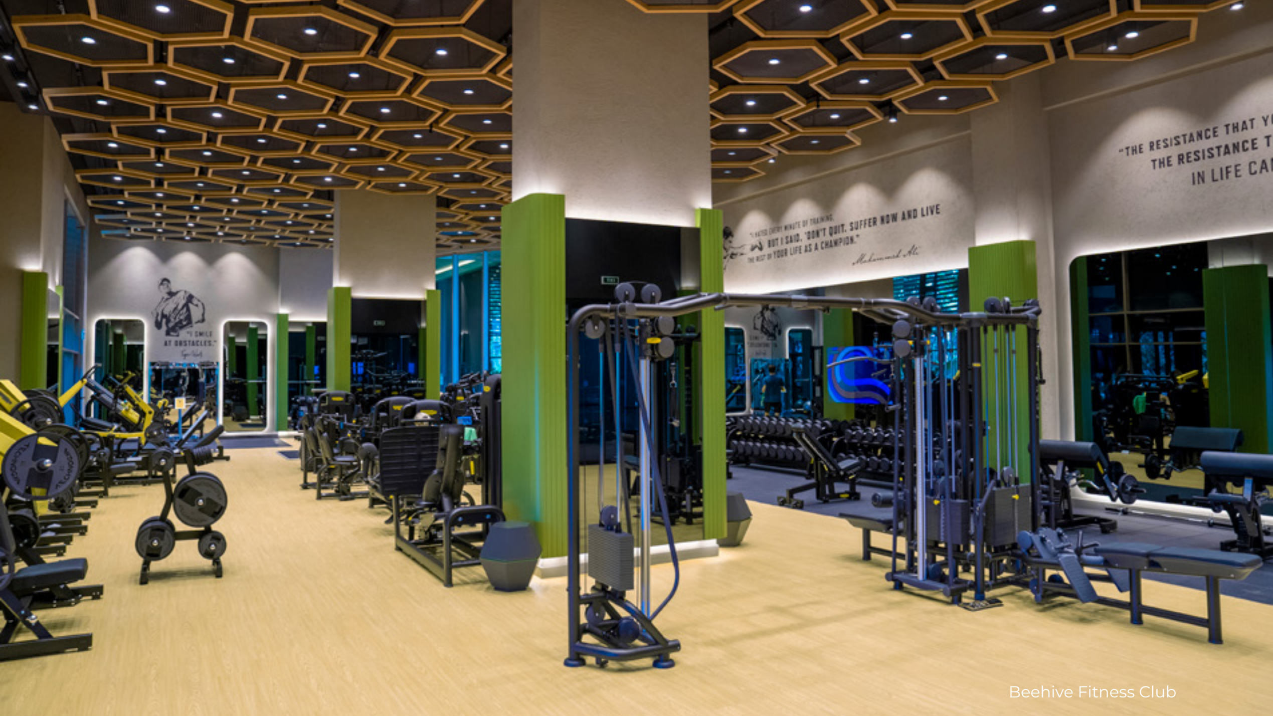
Beehive Fitness Club