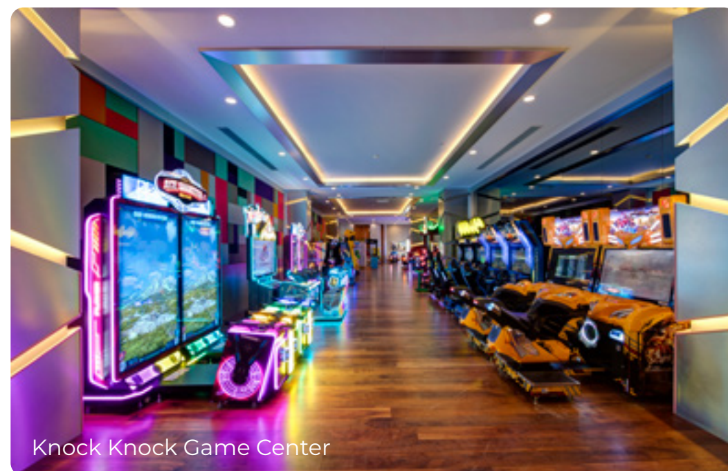
Knock Knock Game Center