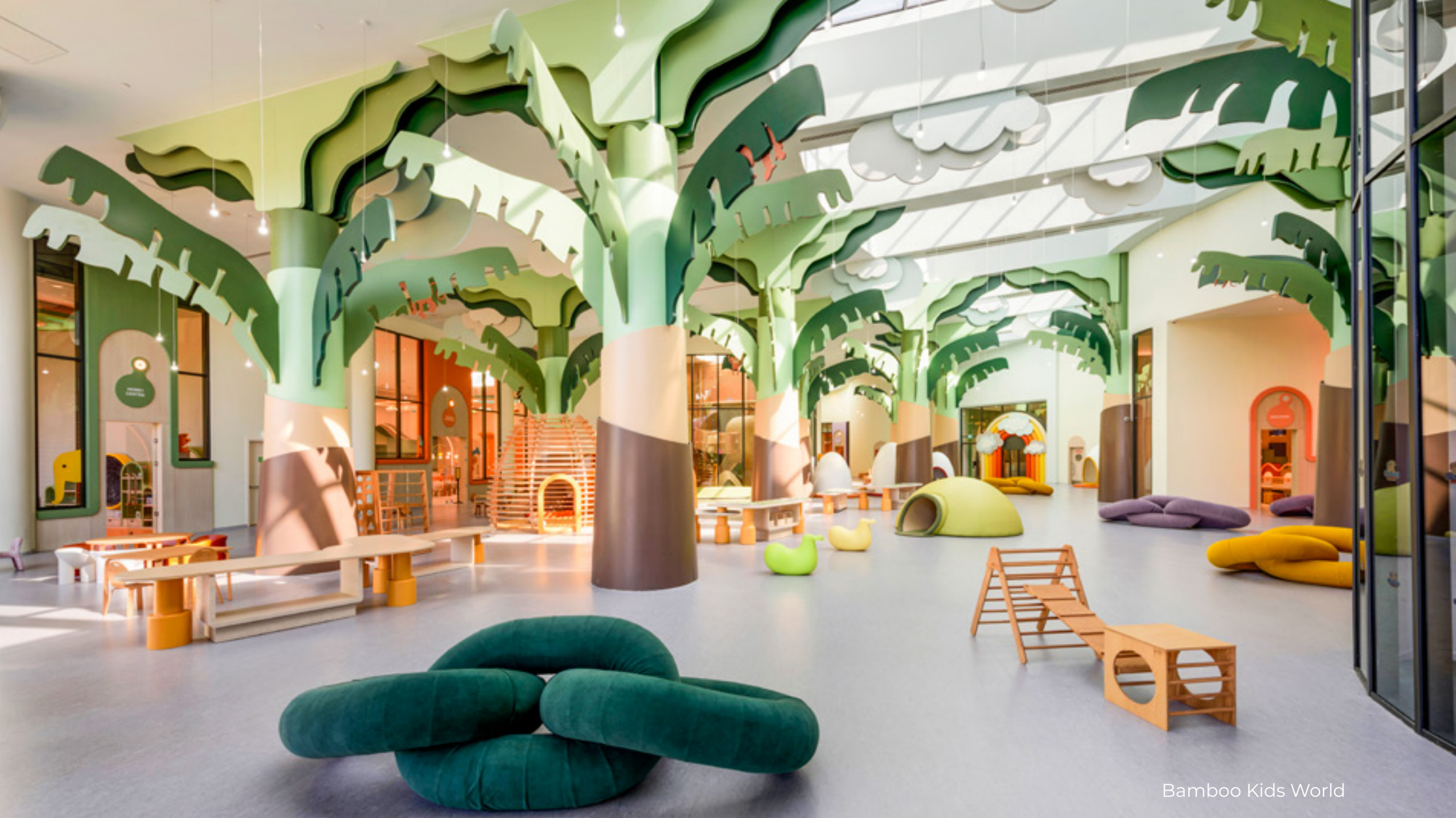
Bamboo Kids World