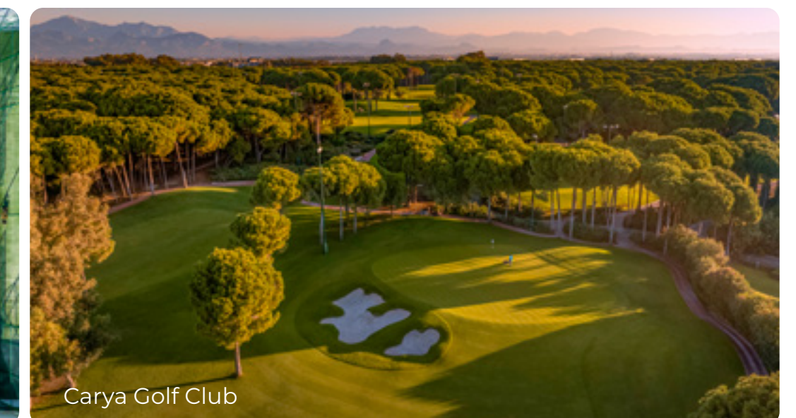
Carya Golf Club