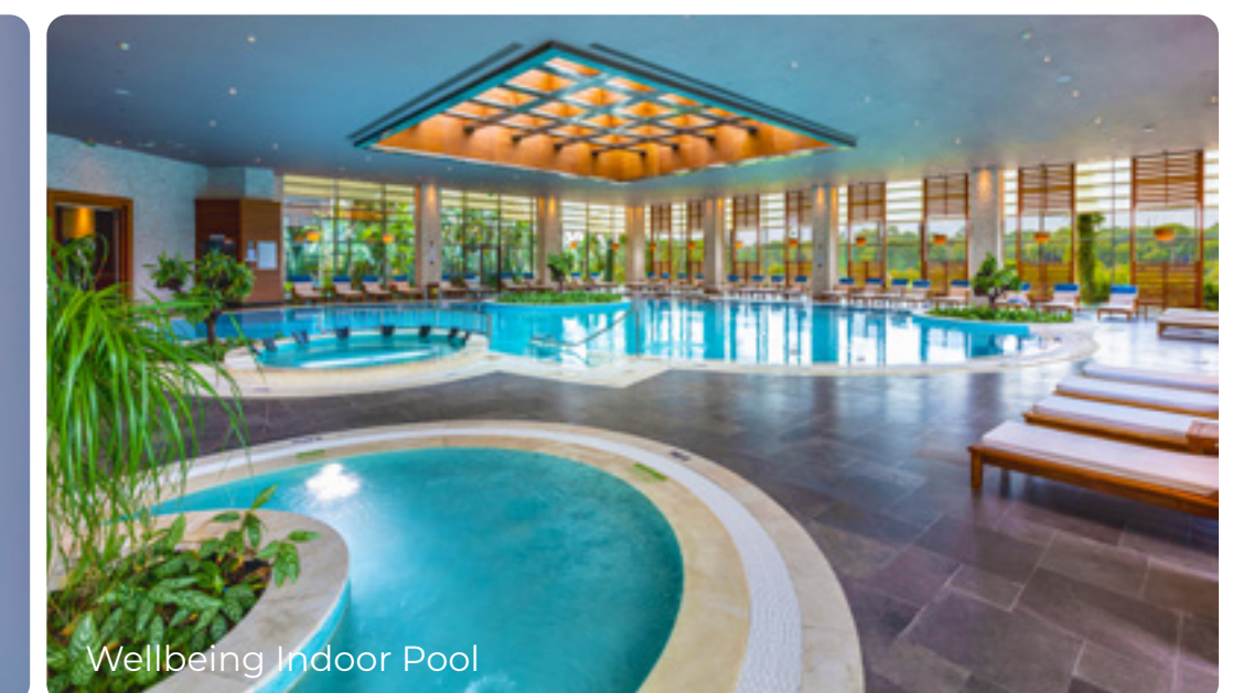
Wellbeing Indoor Pool